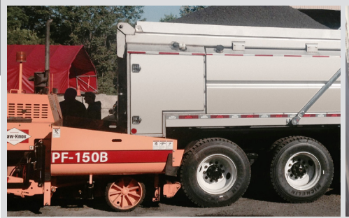
The BlackBelt® Maxx feeds a paving machine like a pro!