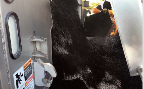
Asphalt can be unloaded incrementally into the paver.