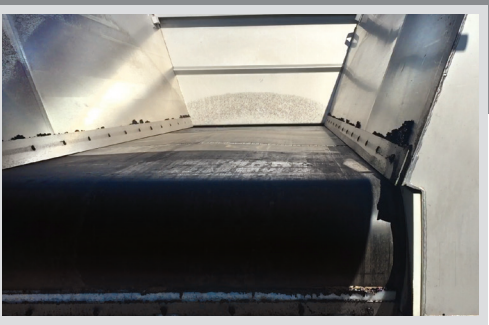
71° sides are self-cleaning.