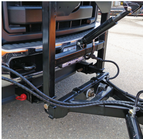
Standard Medium-duty Quick Hitch: for use with MTP & MTP-Flex.

Each torsion spring has a 2-position tension adjustment. Release spring tension completely for zero insertion force and optimum safety during service and maintenance work.