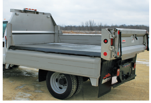
OPTIONAL contoured, tapered headsheet is aerodynamically shaped to complement the new cab designs and increase visibility.

OPTIONAL quick-release, fold-down sides and convenience. The sturdy hinge is positioned beneath the body, oft of the way of falling debris. Sloped surfaces on the sides and floor help shed debris during dumping.