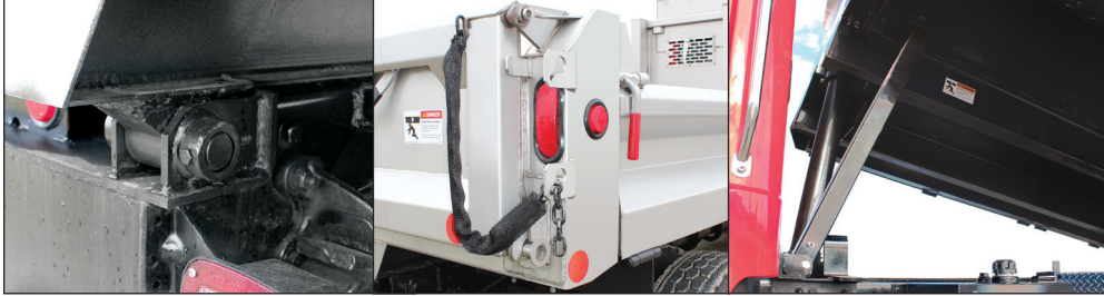
Heavy-duty hinges attached to longitudinal I-beams for strength and stability.