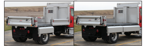
OPTIONAL: Fold-down sides available for each side or both sides.