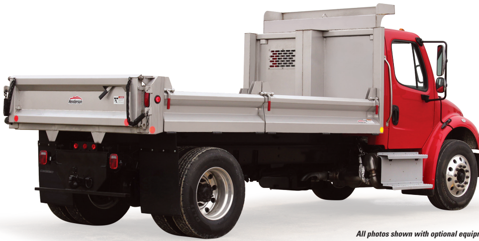
All photos shown with optional equipment.