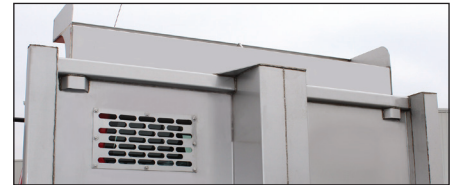
OPTIONAL: Cab shield shown with headsheet window.